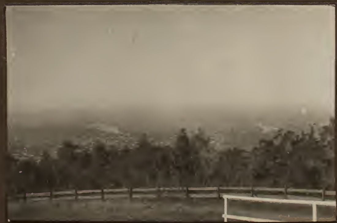
From One Tree Hill Brisbane (Anzac Cove in Distance) 10 vi 28